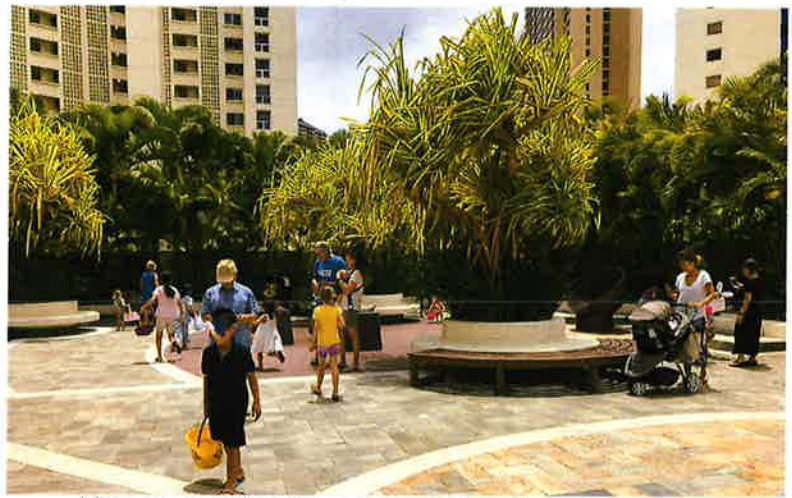
Hope you all enjoyed yourselves!